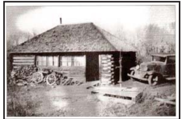
Wild Rose School House - Late 1930's.

Favorite school events for students and parents alike were the Christmas programs held at Wild Rose and the Spring picnic on Big Timber Creek.