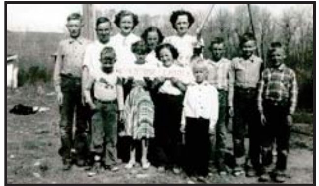
Wild Rose School Class - Spring 1950