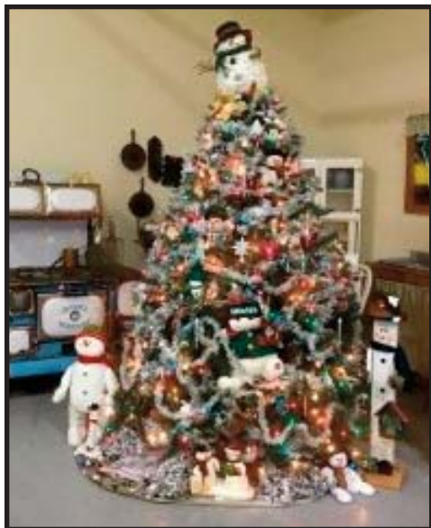
The snowman tree was donated by The Thrift Shop for the Christmas Stroll.

2016 Dues are now due. We are planning a new format for the annual meeting. See you there.